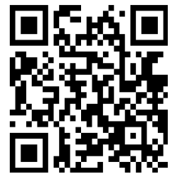
Animation Closing the Loop

A circular economy is a must for a sustainable future. We therefore have to produce and consume in a different way, in which the right choice of materials and designs for reuse play an important role. In addition, it is important that materials are preserved in the cycle. Due to its infinite recyclability, aluminum is the ideal material to promote a circular economy.